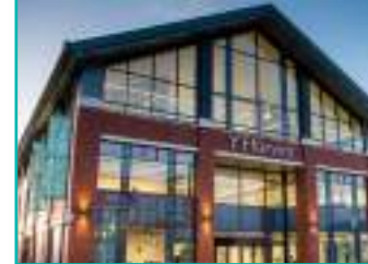
Our new library, Y Fforwm, at SA1 Swansea Waterfront

The LLR is home to the Special Collections and Archives of UWTSU, including the University's oldest printed books, manuscripts and archives. The Special Collections include over 35,000 printed works, eight medieval manuscripts, around 100 post medieval manuscripts, and 69 incunables.